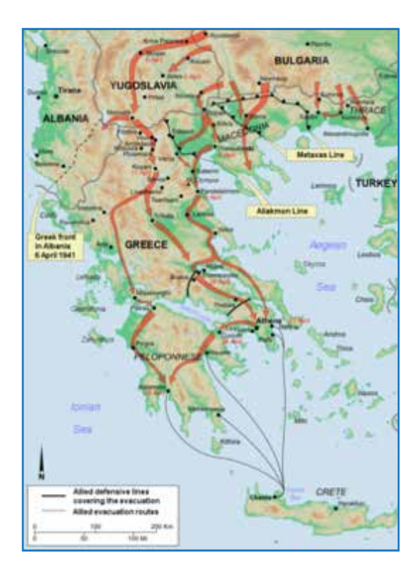
Left: Anzacs on the Acropolis of Athens, April 1941. Right: The 1941 Greek Campaign

1941, 12th April – The Second Anzac Corps was formed out of the Australian and New Zealand units strung out across western Macedonia to resist the Nazi invasion. They fought courageously at Vevi, Florina, Tempe, Volos, Brallos Pass, Thermopylae, Megara and Corinth . Evacuated across the Aegean Sea to the island of Crete, they fought again in the Battle of Crete in May 1941. In the course of the world, over 17,000 Australian soldiers, airmen and sailors served, with 1,001 being wounded, 5,174 taken prisoners and 646 now resting in the Commonwealth War Graves at Phaleron (Athens), Rhodes and Suda Bay, Crete.