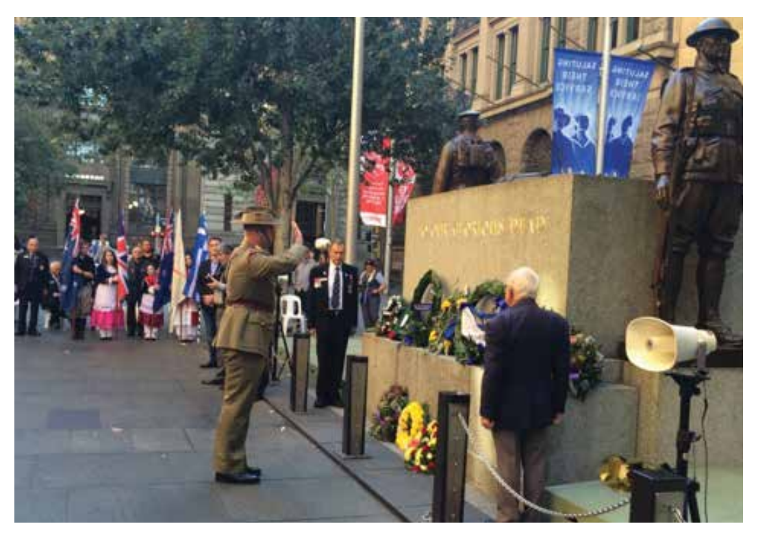
Annual Cenotaph Commemorations and wreath laying service for The Battle of Crete and the Greek campaign in Sydney

1970 – The Joint Committee for the Commemoration of The Battle of Crete and The Greek Campaign was established by the Greek RSL Sub Brach, the 6th Division Association, the Military Police Association and the Cretan Association of NSW to commemorate the anniversary of the The Battle of Crete and the Greek Campaign, the Second Anzac Campaign. The joint committee continues to commemorate the Anzacs and Greek people.