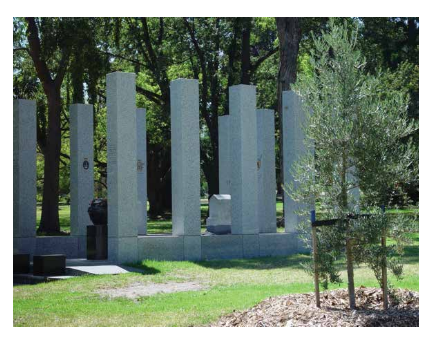
The Australian Hellenic Memorial Melbourne

1992-2001 – The Australian Hellenic Memorial Melbourne was unveiled on the 2nd September 2001 and was dedicated to the Australians and the Greek people that fought in the Battle of Crete and the Greek Campaign.