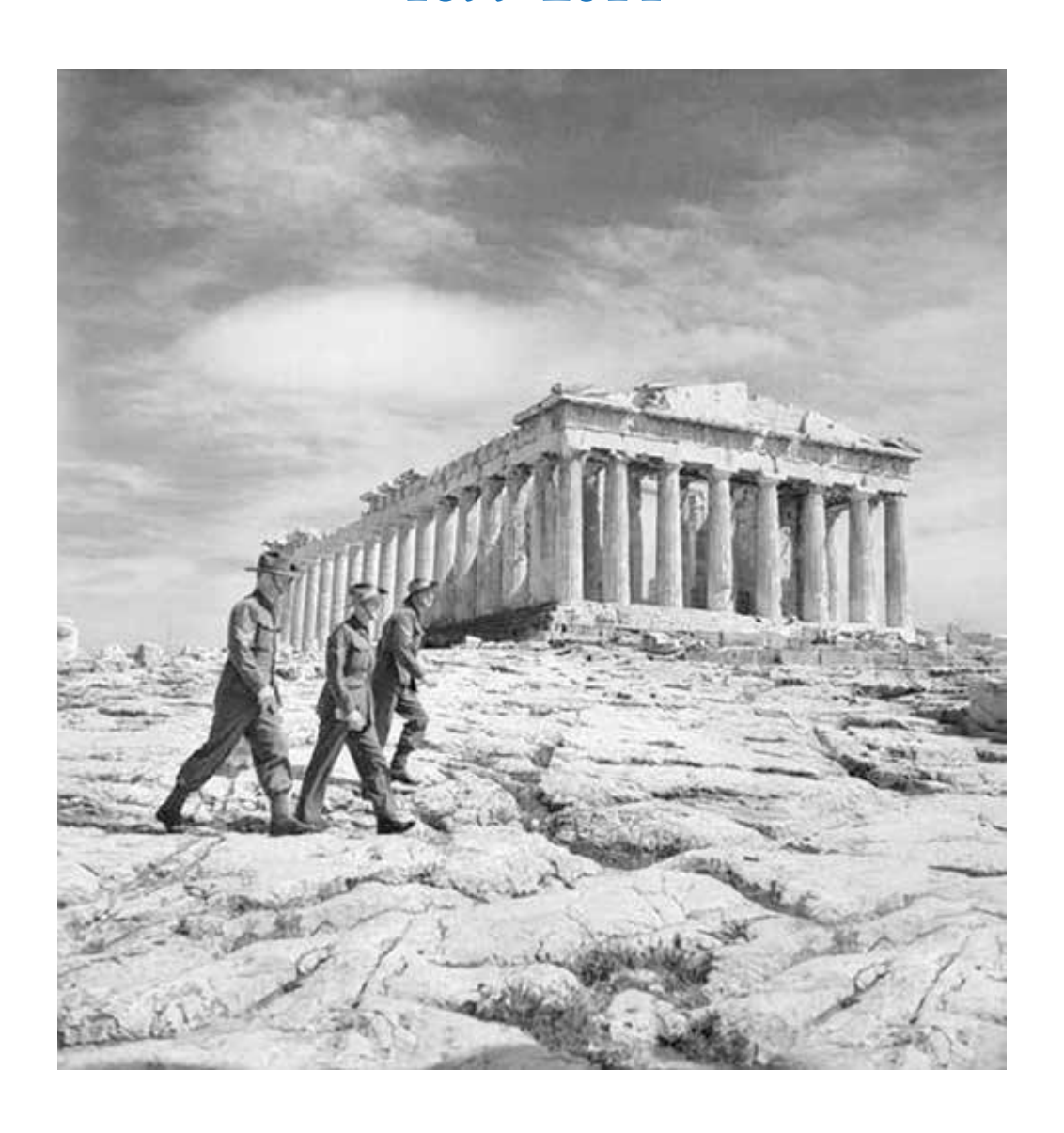
COURAGE • SACRIFICE • MATESHIP PHILOTIMO