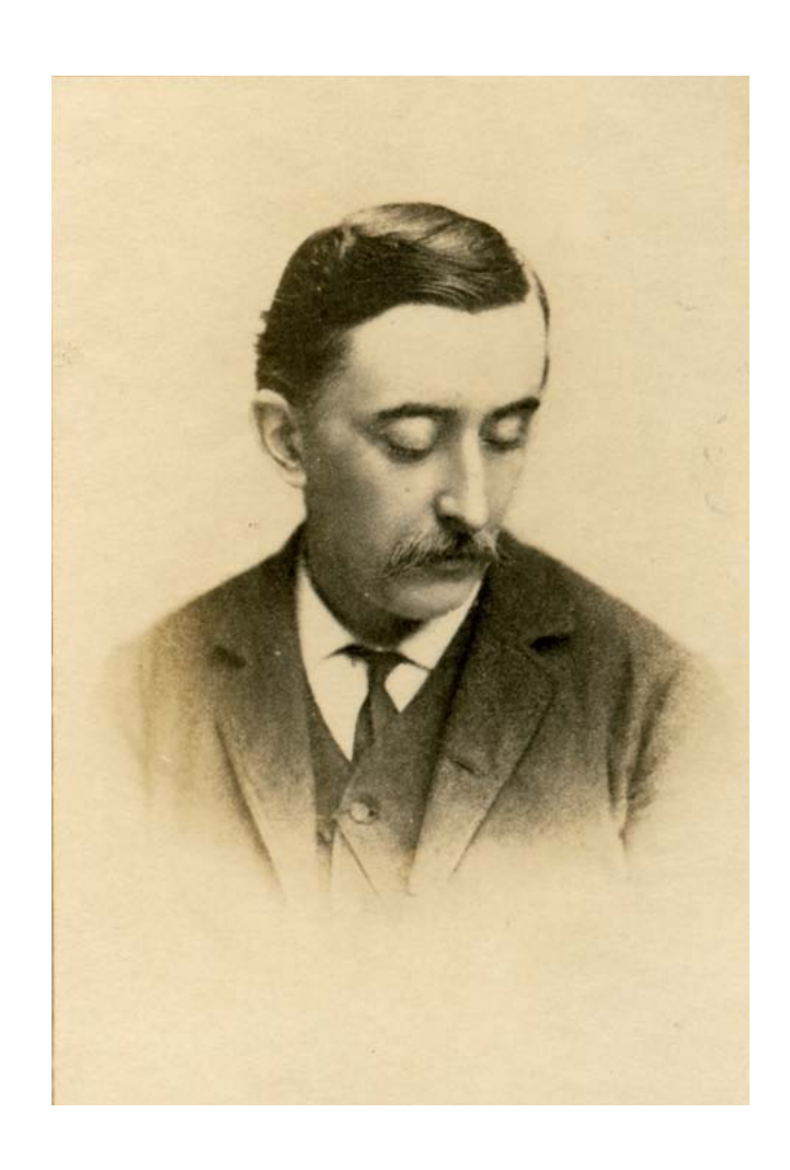
Lafcadio Hearn 1889, Philadelphia