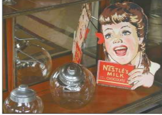
Take a trip down memory lane with a visit to the Roxy Theatre and Roxy Café.