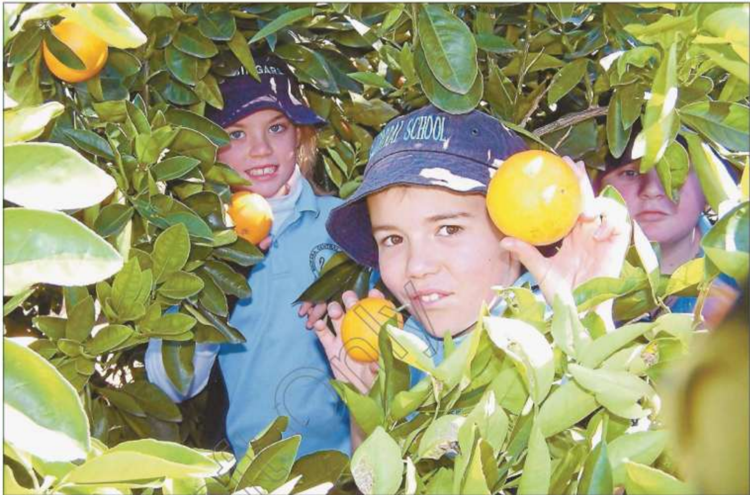
Faces in the orange trees. Bingara Central School students take part in the 2011 picking ritual. This year's pick will be held on Friday.