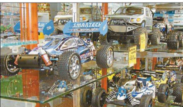
Model cars to suit all budgets and tastes are available at Hobby Mania, Leader's Castle, Gunnedah.