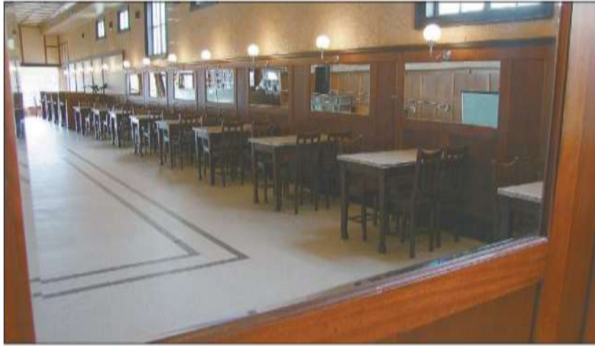
Faithfully restored and refurbished, the interior of the Roxy Café which will open its doors for the first time in almost 50 years this week.