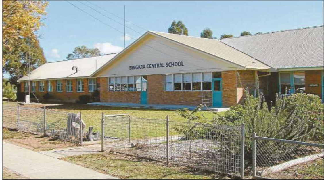
Bingara Central School – 2012.