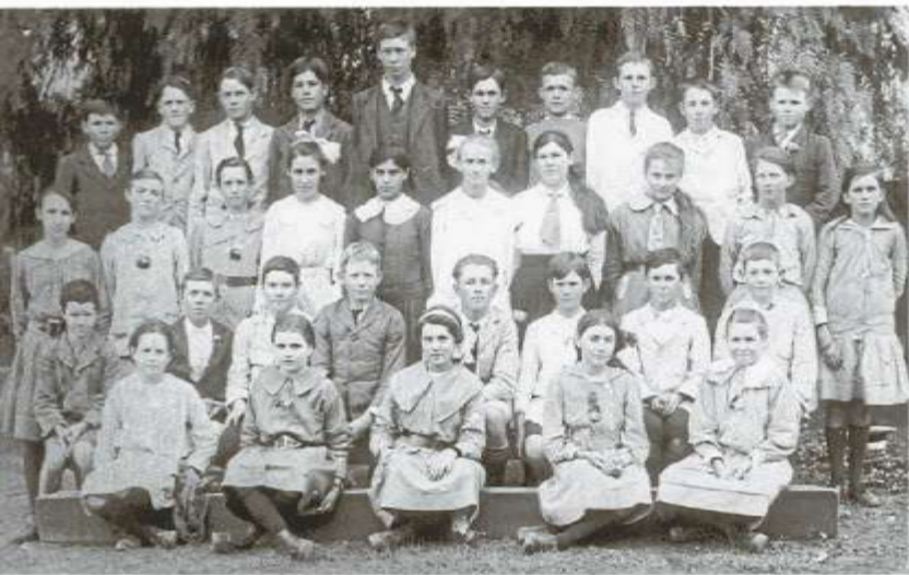
Bingara Public School students, circa 1913.