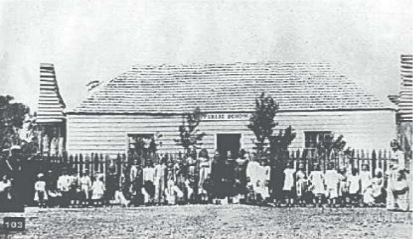
One hundred and fifty years ago, Bingara's first school.