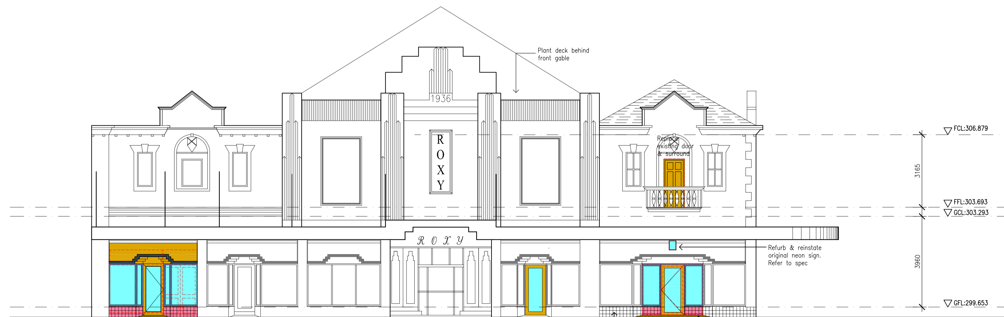
East Elevation 1:100 Scale